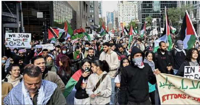
Toronto | October 9, 2023