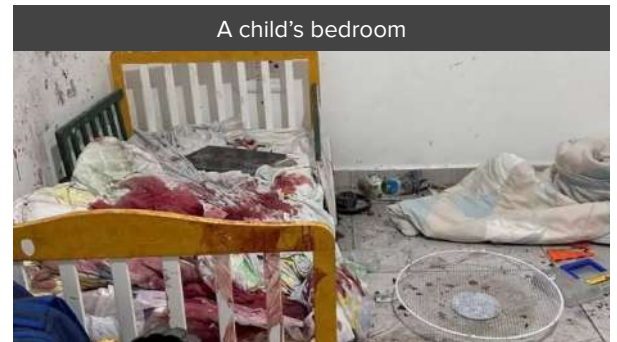
A child's bedroom