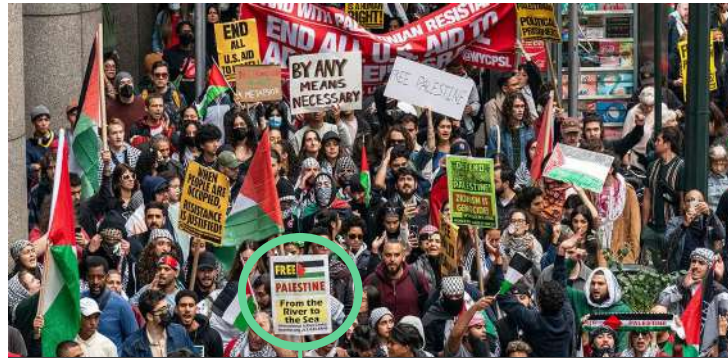
New York City | October 8, 2023