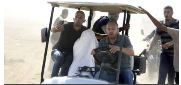
1 of the 100s of hostages taken

Elderly women murdered while live-streamed across their social media accounts for their families to see.