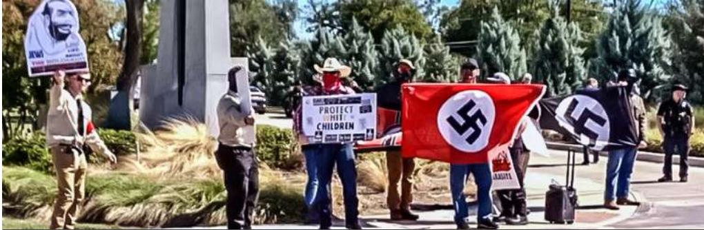
Dallas | Nazis demonstrating outside a church