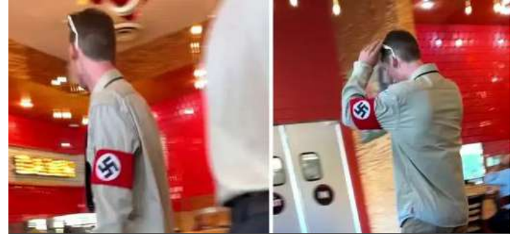
Fort Worth | A man with a swastika armband at Torchy's Tacos

Three decades of data show that conflicts in Israel lead to big jumps in Jewish hate crimes across the US